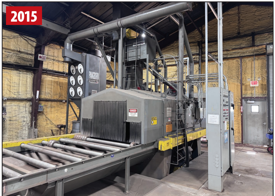
PANGBORN ES-1821-126 ROTOBLAST ROLLER CONVEYOR BLAST MACHINE