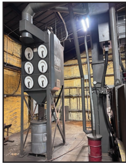
PANGBORN/TORIT DF03-6 DUST COLLECTION SYSTEM