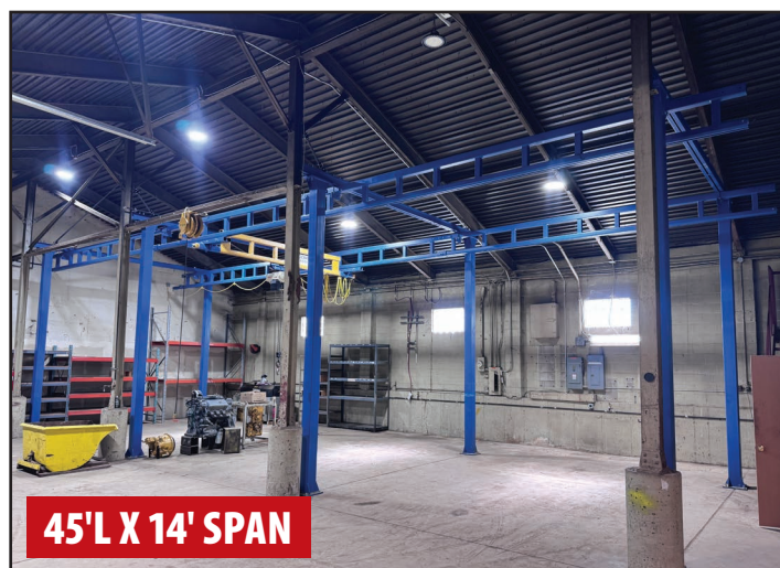
GORBEL 2-TON FREE STANDING BRIDGE CRANE