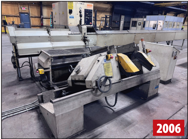
KASTO WAS90R AUTOMATIC COLD SAW

2008 HEM VT 120HA 60 SMART SAW AUTOMATIC VERTICAL BAND SAW , s/n 1043408, w/ Free Standing Control Console (Smart Saw System), 90° Saw Capacity: 18" x 24", Left Miter Capacity: 18" x 16" @ 45°, 18" x 10" @ 60°, Right Miter Capacity: 18" x 14.75" @ 45°, 18" x 9" @ 60°, 3° Arm Cant, 1.25" x 16'6" x 0.42" Blade Size, 7.5 HP Blade Drive, 5 HP Hydraulic System, 60-400 SFPM Variable Speed Drive, 72" Shuttle Vise, Coolant System, Auto Feed System, Full Capacity Tool Clamp, Power Tilt, Coolant System, Blade Chip Brush (Located in Eldridge, IA)