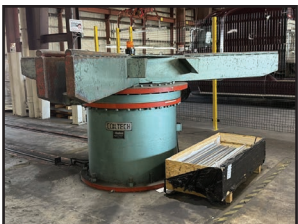
COILTECH 4-ARM TURNSTILE