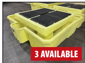
ULINE H-4436 IBC SPILL CONTAINMENT PLATFORM