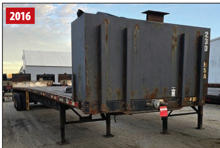
MANAC 10248K011 FLATBED TRAILER

For auction inquiries, please contact Jennifer Reiner at (847) 545-6374 or jennifer@perfectionindustrial.com