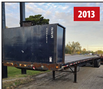
GREAT DANE GPS-0023-00048 FREEDOM FLATBED TRAILER