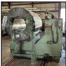
40,000 LB COIL CAR