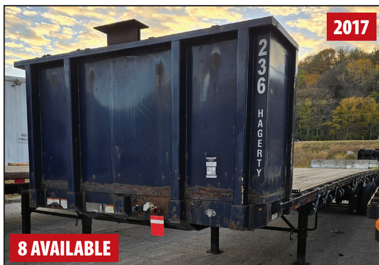
GREAT DANE GPS-0023-00048 FREEDOM FLATBED TRAILER