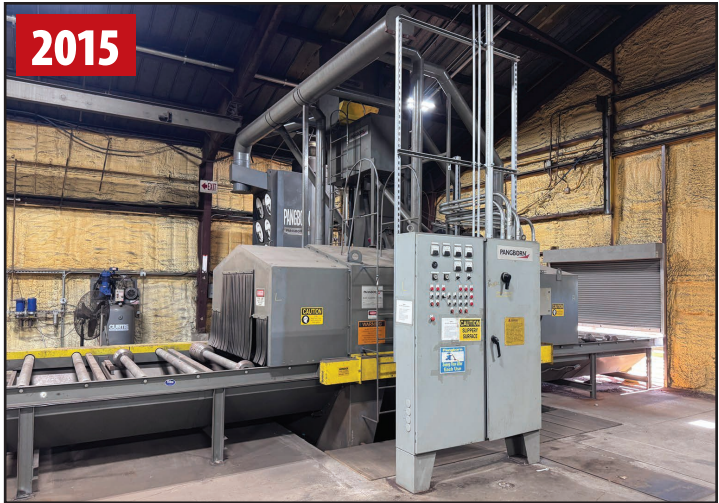
PANGBORN ES-1821-126 ROTOBLAST ROLLER CONVEYOR BLAST MACHINE