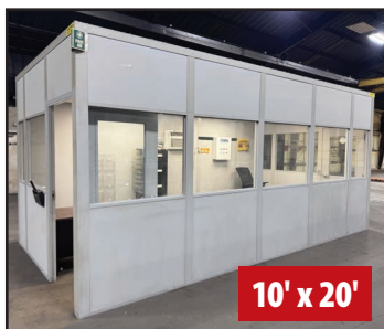
STARRCO MODULAR PLANT OFFICE