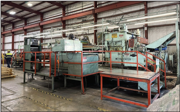
DELTA 72" X .250" CUT-TO-LENGTH LINE

DELTA 72" X .250" CUT-TO-LENGTH LINE , s/n na, w/ Unico PLC Control Station (Delta Software), 72" Max. Coil Width, 72" Max. Coil OD, 240" Coil Length, 50,000 lb. Max. Coil Weight, Material Thickness: .05"-.25" Aluminum Thickness, .188" Carbon Steel, .135" Stainless, COILTECH 4-Arm Turnstile, Uncoiler w/ Snubber Roll, Peeler Table, DELTA 19 Roll 4-Hi Precision Leveler w/ 250 HP Motor, 40,000 lb. Capacity Traveling Coil Car w/ Elevation & In/Out Movement, Automatic Stacker, 250 HP DC Drive (Located in San Antonio, TX) Please Note: Leveler Requires Screw Jack Replacement