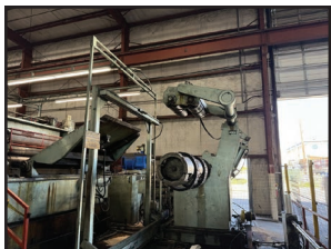
UNCOILER W/ SNUBBER ROLL