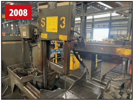
HEM VT 120HA 60 SMART SAW AUTOMATIC VERTICAL BAND SAW