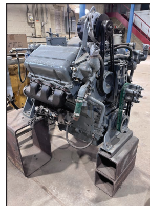
DETROIT DIESEL V6 REBUILT MOTOR