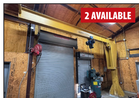
GORBEL 1-TON FREE STANDING JIB CRANE

DEMAG 1/2-TON JIB CRANE , w/ Approx. 12'H x 13' Reach