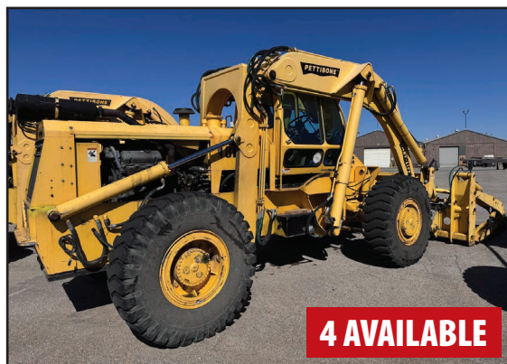
PETTIBONE SUPER 20 204-H CARY-LIFT ROUGH-TERRAIN FORKLIFT