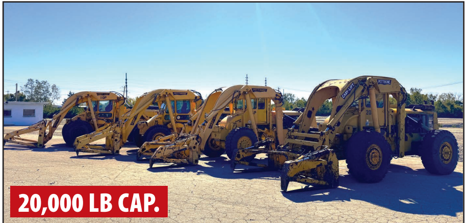
(4) PETTIBONE SUPER 20 204-H CARY-LIFT RT FORKLIFTS

FEATURING: 2015 PANGBORN ES-1821-126 ROTOBLAST ROLLER CONVEYOR SHOT BLAST SYSTEM, DELTA 72" X .250" CUT-TO-LENGTH LINE, 2006 KASTO WAS 90R AUTOMATIC COLD SAW, 2008 HEM VT 120HA 60 SMART SAW AUTO. VERT. BAND SAW, (4) PETTIBONE SUPER 20 CARY-LIFT 20,000 LB. RT FORKLIFTS, (4) DIESEL FORKLIFTS, (9) GREAT DANE & MANAC 48' FLATBED TRAILERS, FREE STANDING CRANES, FACTORY SUPPORT EQUIPMENT, AND MORE