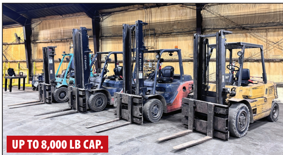
CAT, TOYOTA, MITSUBISHI DIESEL FORKLIFTS

MITSUBISHI FD30K 6,000 LB. DIESEL FORKLIFT , s/n AF14C-35102, w/ 48" Fork Length, Fork Positioners, 94" Lowered Mast Height, Pneumatic Tires, 7,756 Hours