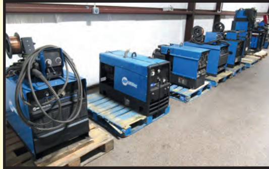
MILLER SUB ARC DC650 WELDER AND MORE!