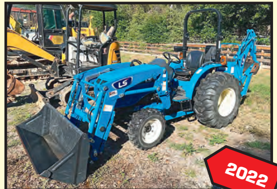
2022 LS MDL. MT225E UTILITY TRACTOR

Tuesday & Wednesday, December 3 & 4, 9:00 A.M. to 4:00 P.M. Daily