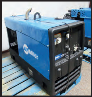
MILLER TRAILBLAZER 275 DC PORTABLE WELDER