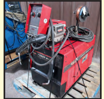
LINCOLN POWERWAVE 455 W/FEEDER

WELDING POWER SOURCES & PLASMA CUTTER WIDE SELECTION INCL.: (2) MILLER DYNASTY 300DX TIG MILLER CST280-T1-NL STICK/TIG; LINCOLN DC-655 SUBARC, w/S74 wire feeder; MILLER DELTAWELD 450, w/22A MIG feeder; LINCOLN DC-600; MILLER SYNCROWAVE 351 TIG; LINCOLN POWERWAVE 455, w/Power Feed 10 MIG feeder; LINCOLN TIG 300 PKG, air cooled; LINCOLN INVERTEC V-350 PRO 7, w/DH-10 MIG feeder; LINCOLN DC-655; MILLER DIMENSION NT 450; MILLERMATIC 350P MIG; (6) MILLER XMT 350 CC/CV; MILLER SHOPMASTER 300 MIG MULTIPROCESS; LINCOLN FLEXTAC 450 MIG; MILLER INVISION 456P MIG; MILLER MAXSTAR 200 STICK/TIG; LINCOLN POWERWAVE 450 MIG; (3) LINCOLN LN 25 CLASSIC SUITCASE WIRE FEEDERS; MILLER VINTAGE CP-200 ALUMINUM MIG; HYPER-THERM 45 PORTABLE PLASMA CUTTER; MORE!