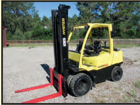
HYSTER 8,000-LB. BASE CAP. LPG FORKLIFT