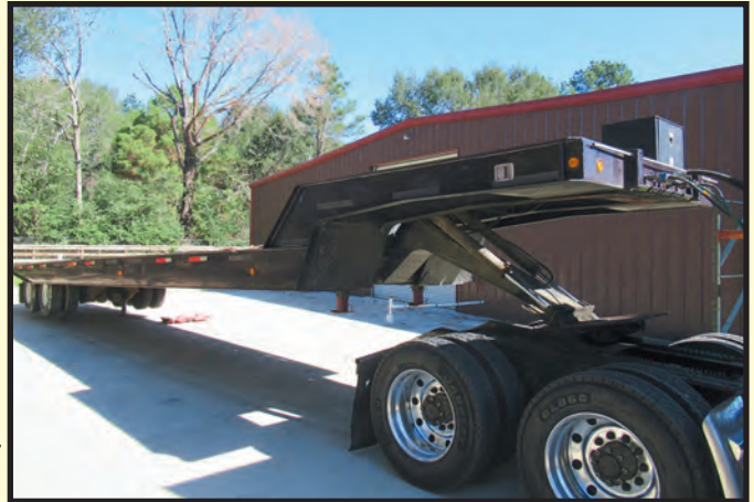
LANDOLL MDL 317 TRAVELING TAIL TRAILER