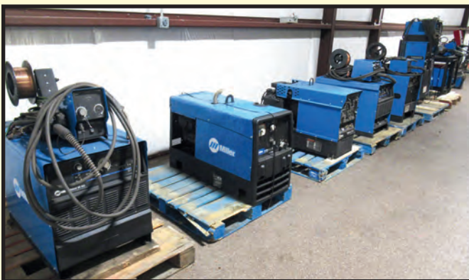
PARTIAL VIEW LARGE QUANTITY OF WELDERS

Read Partial Terms and Conditions on Page 7