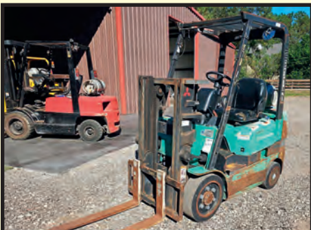
MITSUBISHI 4,400-LB. BASE CAP. LPG FORKLIFT