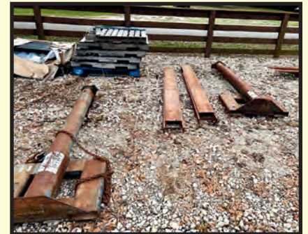
ASSORTED FORKLIFT BOOMS AND FORK EXTENSIONS

CRAWLER EXCAVATORS 2020 SANY MDL. SY135C , w/24", 36", and 48" buckets, diesel, operating weight: 32,783-lbs., transport dims.: 24'7"L., 8'6"W. and 9'3"H., tail swing radius: 7'6", boom length: 15'1", max. digging depth: 18', gross power: 103.3 HP, _____ H.O.M., S/N SY013JBK35108. 2020 SANY MDL. SY35U MINI , w/12", 24", 48" buckets, blade, engine, open cab, operating weight: 8,499-lbs., gross power: 24.4 horsepower (18.2 kW), dig depth: 10'2", boom length: 8'4", stick length: 4'7" standard shoe track width: 12", _____ H.O.M., S/N SY0033CA05288.