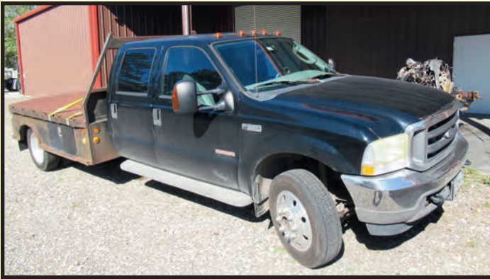
FORD F-550 FLATBED TRUCK