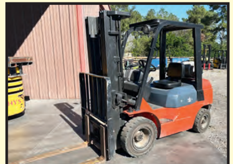
TOYOTA 5,000-LB. BASE CAP. LPG FORKLIFT

INSPECTION: Tuesday & Wednesday, December 3 & 4, 9:00 A.M. to 4:00 P.M. Daily