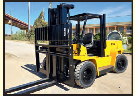
YALE 15,500-LB. BASE CAP. LPG FORKLIFT