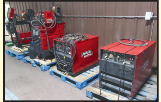
WIDE SELECTION OF LINCOLN WELDERS