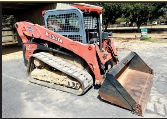
KUBOTA SVL900-2 SKID STEER LOADER

THURSDAY, DECEMBER 5 10:00 A.M. LIVE ONLINE WEBCAST (NO ONSITE BIDDING)