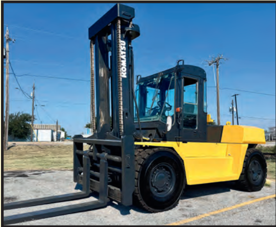
KOMATSU 30,000-LB. BASE CAP. DIESEL FORKLIFT

FORKLIFTS, RIGGING EQUIPMENT, SERVICE TRUCKS, TRAILERS INCL. LANDOLL TRAVELING TAIL, MOWERS, WELDING MACHINES, SHOP TOOLS, UTILITY TRACTORS, SKID STEER LOADERS, POWER TOOLS, CRAWLER EXCAVATORS, WIDE FORMAT PRINTER, MORE!