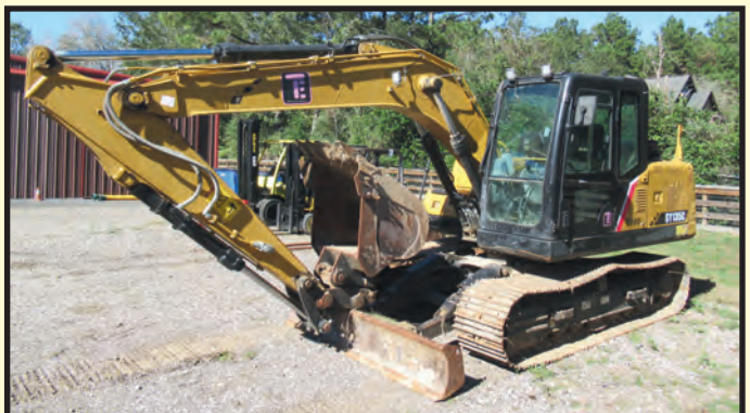
2020 SANY MDL SY135C CRAWLER EXCAVATOR