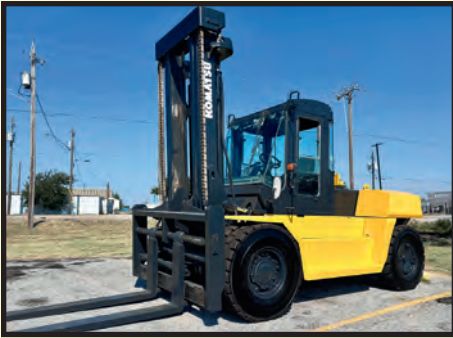
KOMATSU 30,000-LB. BASE CAP. DIESEL FORKLIFT