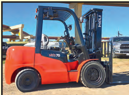
HELI 7,000-LB. BASE CAP. DIESEL FORKLIFT