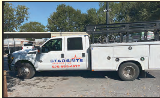
2015 FORD F-350 SERVICE TRUCK