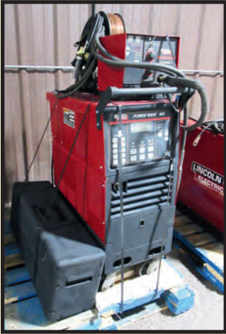
LINCOLN POWERWAVE 450 WELDER W/SYNERGIC 7 WIRE FEED

WELDING POWER SOURCES & PLASMA CUTTER WIDE SELECTION INCL.: (2) MILLER DYNASTY 300DX TIG MILLER CST280-T1-NL STICK/TIG; LINCOLN DC-655 SUBARC, w/S74 wire feeder; MILLER DELTAWELD 450, w/22A MIG feeder; LINCOLN DC-600; MILLER SYNCROWAVE 351 TIG; LINCOLN POWERWAVE 455, w/Power Feed 10 MIG feeder; LINCOLN TIG 300 PKG, air cooled; LINCOLN INVERTEC V-350 PRO 7, w/DH-10 MIG feeder; LINCOLN DC-655; MILLER DIMENSION NT 450; MILLERMATIC 350P MIG; (6) MILLER XMT 350 CC/CV; MILLER SHOPMASTER 300 MIG MULTIPROCESS; LINCOLN FLEXTAC 450 MIG; MILLER INVISION 456P MIG; MILLER MAXSTAR 200 STICK/TIG; LINCOLN POWERWAVE 450 MIG; (3) LINCOLN LN 25 CLASSIC SUITCASE WIRE FEEDERS; MILLER VINTAGE CP-200 ALUMINUM MIG; HYPER-THERM 45 PORTABLE PLASMA CUTTER; MORE!