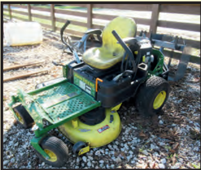
JOHN DEERE ZERO TURN MOWER

THURSDAY, DECEMBER 5 • 10:00 A.M. LIVE ONLINE WEBCAST (NO ONSITE BIDDING)