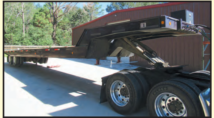
LANDOLL MDL. 317 TRAVELING TAIL TRAILER