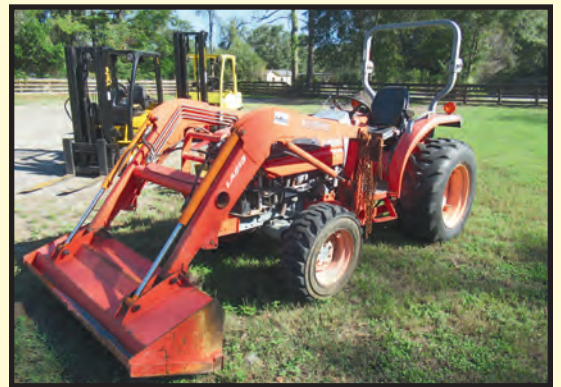
KUBOTA MDL. L3130D UTILITY TRACTOR W/BUCKET

THURSDAY, DECEMBER 5 10:00 A.M. LIVE ONLINE WEBCAST (NO ONSITE BIDDING)