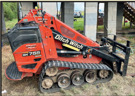
DITCH WITCH SK755 W/ATTACHMENTS

YOU MUST REGISTER IN ADVANCE FOR ONLINE BIDDING AT THIS AUCTION.