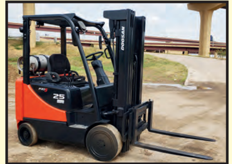
DREXEL 3,000-LB. BASE CAP. ELECTRIC FORKLIFT

MITSUBISHI 4,400-LB. BASE CAP. MDL. FGC20K1 , LPG engine, 2-stage mast, Trucker Special, S/N AE82C06004.