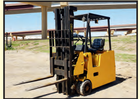
DOOSAN 5,000-LB. BASE CAP. LPG FORKLIFT