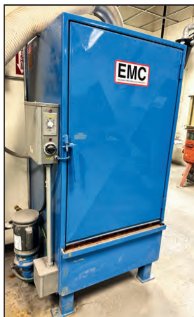
EMC 2846E ROTARY WASH SYSTEM