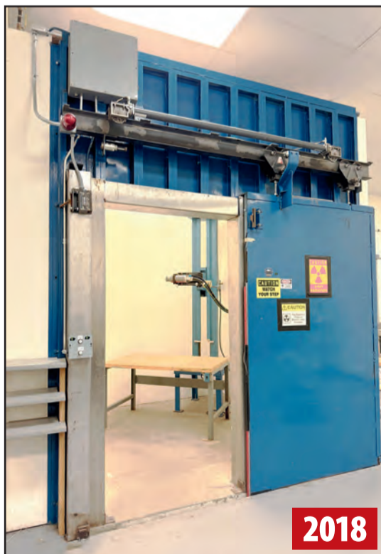
COMET IXRS X-RAY SYSTEM AND ENCLOSURE