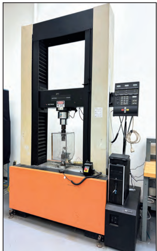
INSTRON 4400R TENSILE TESTER

ALSO: Height Gages, Outside Micrometers, Digital Calipers, Gage Blocks, Dial Calipers, Inside Micrometer, Angle Plates and More