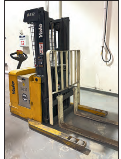
YALE MRW020LEN24TV072 2,000 LB REACH STACKER