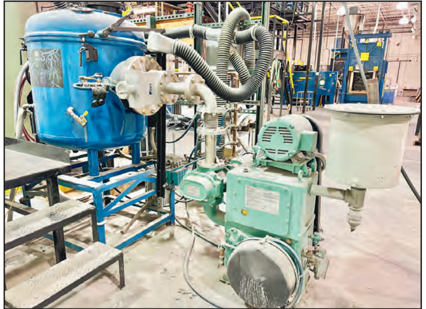
VACUUM INDUCTION MELTING (VIM) FURNACE