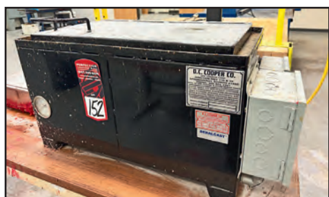
DC COOPER CO. W-10 WAX MELTING TANK