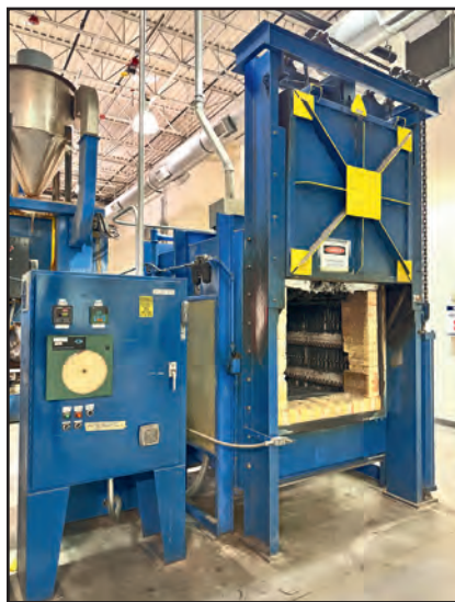
TEDESCO THERMAL TECHNOLOGY EB364836 ELECTRIC OVEN

SLURRY HOLDING TANK, w/ Agitator and Enclosure