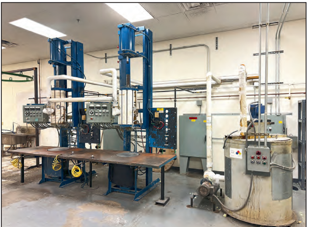
(2) ARWOOD PNEUMATIC INJECTION PRESSES