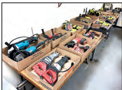
VIEW OF POWER TOOLS