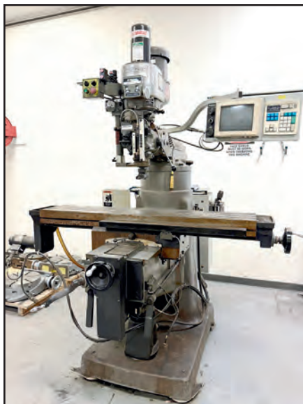
BRIDGEPORT EZ TRAK DX II 3-AXIS MILLING MACHINE