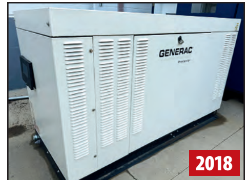
GENERAC PG04564KNAC 45 KW NATURAL GAS GENERATOR

All small items must be removed by Monday, September 2. All other items must be removed by Friday, September 20. All removal is strictly on an appointment only basis. Anyone removing purchased items with a lift truck or another powered vehicle must have a certificate of insurance with a $2M General Liability policy, the policy must include a Worker's Compensation rider, and that certificate of insurance must be provided to the auctioneer for review and approval prior to the auction.