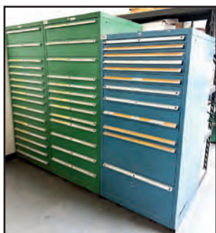
VIEW OF LISTA CABINETS