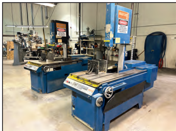
(2) MARVEL MARK 1 SERIES 8 VERTICAL BANDSAWS