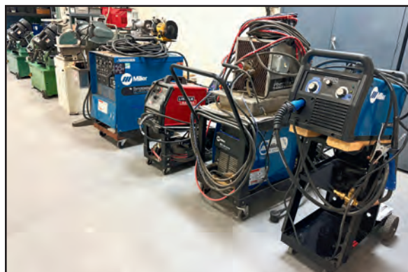
VIEW OF WELDING EQUIPMENT

ALSO: Welding Accessories Including Auto-Darkening Helmets, Electrodes, and Guns