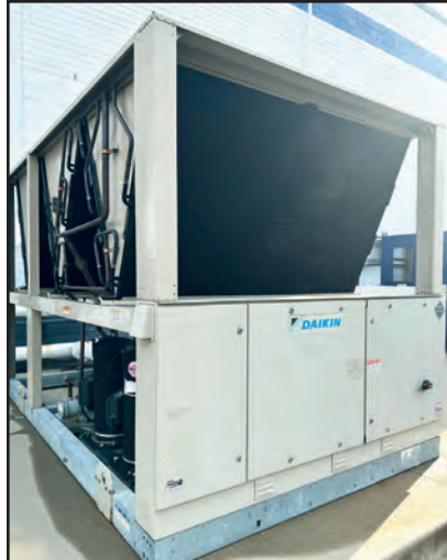
DAIKIN AGZ075EDSEPN00 75-TON AIR COOLED SCROLL CHILLER