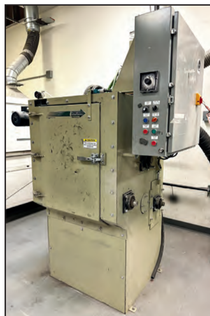
CLEMCO DIA ROTARY TUMBLAST