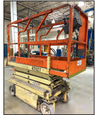
JLG 1932-E2 SCISSOR LIFT