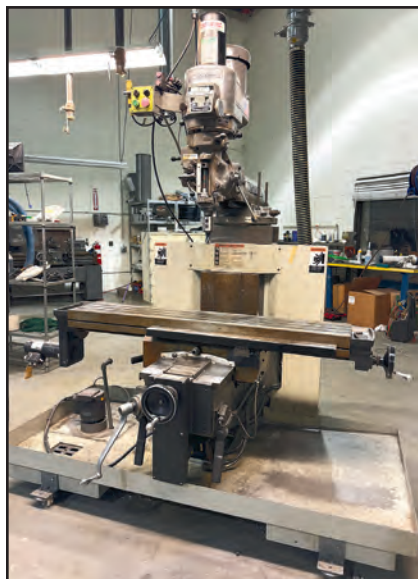
BRIDGEPORT EZ TRAK DX II MILLING MACHINE