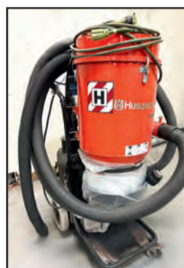
HUSQVARNA S26 HEPA DUST EXTRACTOR

(2) BUEHLER ECOMET 5 TWO-SPEED GRINDER/POLISHERS, s/n 429-E5G-215 and 430-E5G224