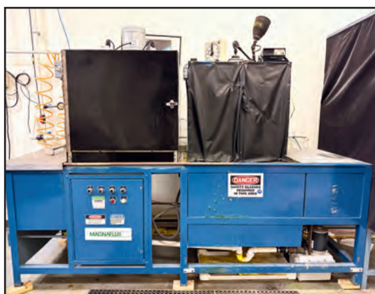
MAGNAFLUX ZYGLO ZA-28W PARTICLE INSPECTION MACHINE