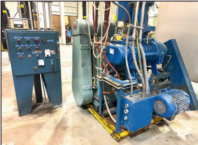
TEVTECH 10 HP VACUUM PUMP SYSTEM

2007 AJAX TOCCO PACER II SOLID STATE POWER SUPPLY, s/n 78-1094-25, w/ Input Rating 480-528 Volts, 400 KW, 3,000 Hz., Output Rating 1,875