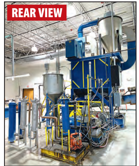
INDUCTOTHERM POWER-TRAK 225-30R VIP 225 KW POWER SUPPLY