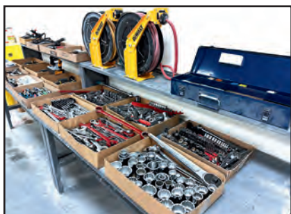
VIEW OF HAND TOOLS