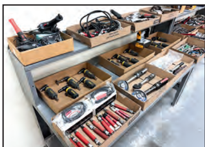
VIEW OF ASSORTED TOOLS