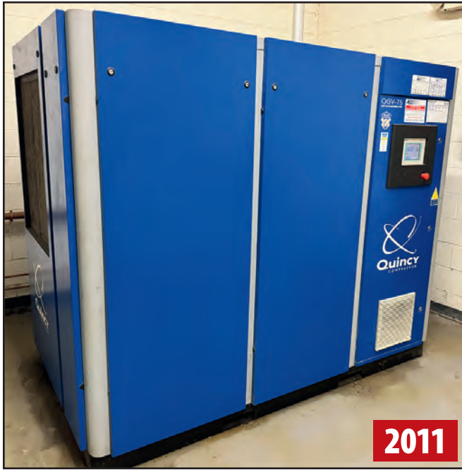
QUINCY 75 HP ROTARY SCREW AIR COMPRESSOR