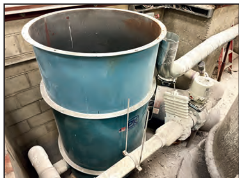
PACIFIC KILN WET SAND TANK