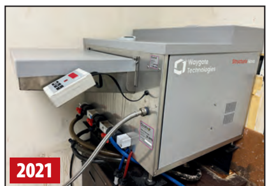
WAYGATE TECHNOLOGIES INDUSTRIAL FILM PROCESSOR