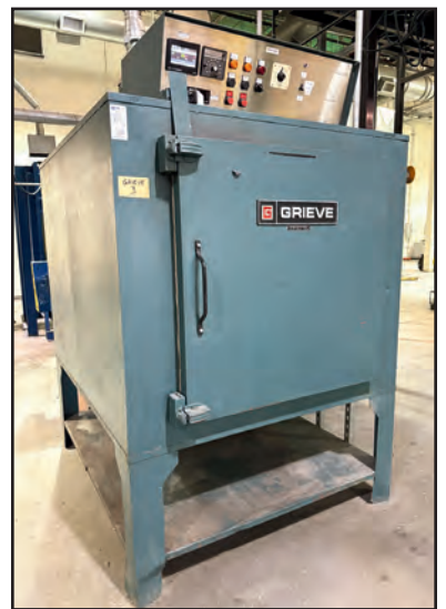
GRIEVE AG-850 ELECTRIC OVEN