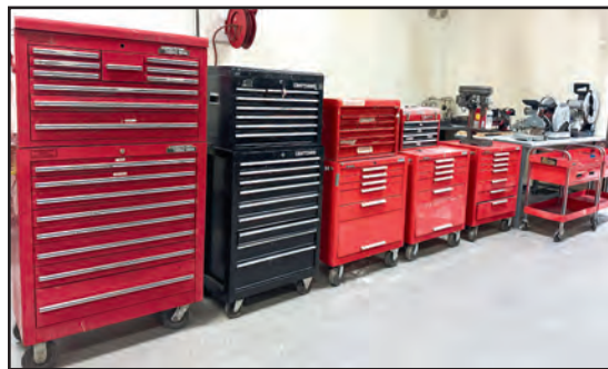
VIEW OF TOOL BOXES