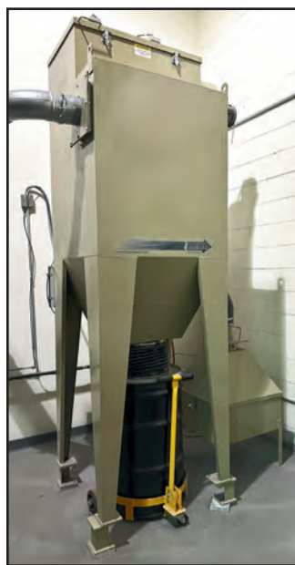
CLEMCO ZERO RPH-2 REVERSE PULSE DUST COLLECTION SYSTEM