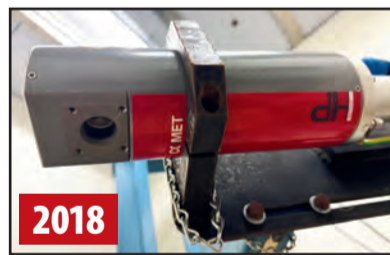
COMET IXRS X-RAY SYSTEM