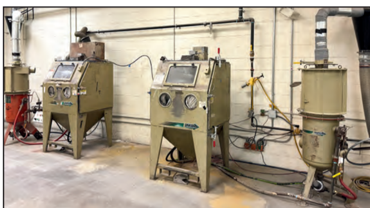
(2) CLEMCO ZERO BNP-65 BLAST CABINETS

BUEHLER 20-1310-115 SPECIMEN MOUNT PRESS, s/n 535-FN-7426