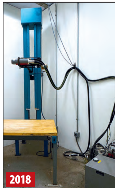
COMET IXRS X-RAY SYSTEM