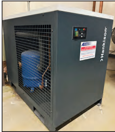
HANKISON HGE500 COMPRESSED AIR DRYER