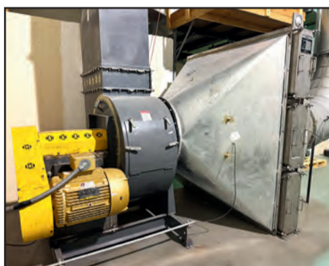
BARNEBEY SUTCLIFFE CALGON CARBON DUST CONTAINMENT SYSTEM