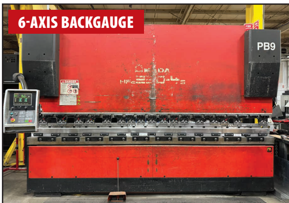
AMADA HFE-220-4-S CNC PRESS BRAKE