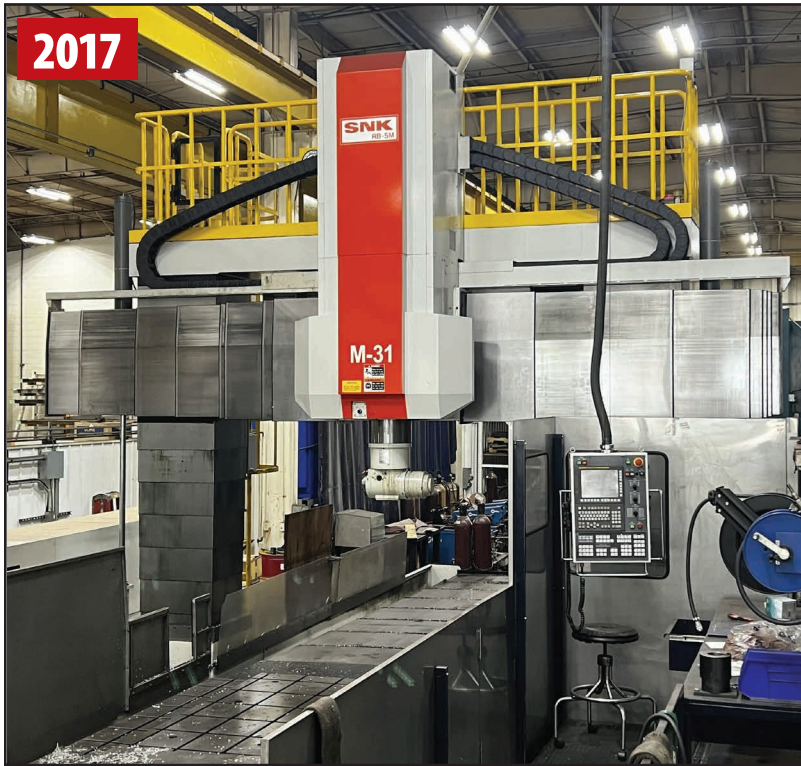
SNK RB-5M CNC BRIDGE MILL