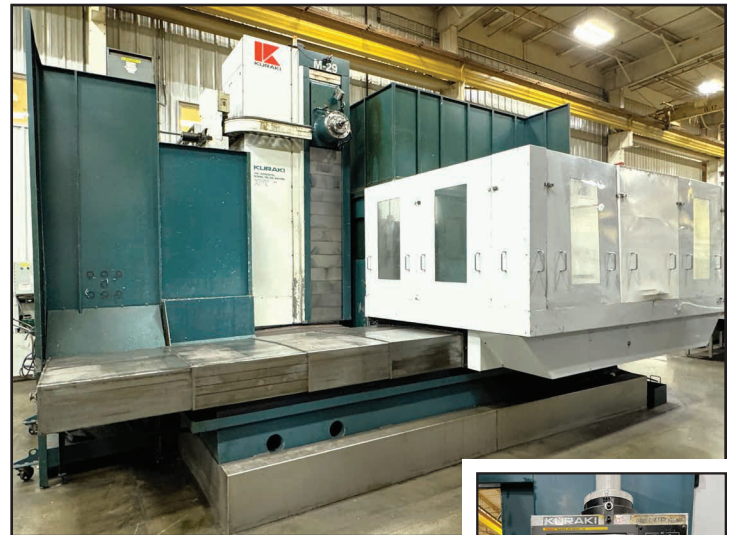
KURAKI KBT-13A CNC TABLE TYPE HBM