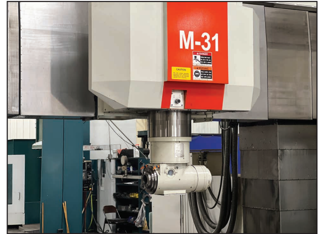
SNK RIGHT ANGLE HEAD

2017 SNK RB-5M CNC BRIDGE MILL, Fanuc 31i-B CNC Control, 196.8" x 98.4" Table, Travels: X-206.6", Y-133.8", Z-31.5", W-55.1", 122" Between Columns, Table Capacity 33,000 Lbs., Right Angle Head (1 Degree Indexing), Spindle Speeds 40-4500 RPM, 50 Taper, 60-Position Automatic Tool Changer, Automatic Attachment Changer, Hennig Chip Conveyor & Coolant Pump System, 4th-Axis Capable, Coolant Thru Spindle, Renishaw RMP60 Probe, 60 HP Spindle Motor, S/N 453937