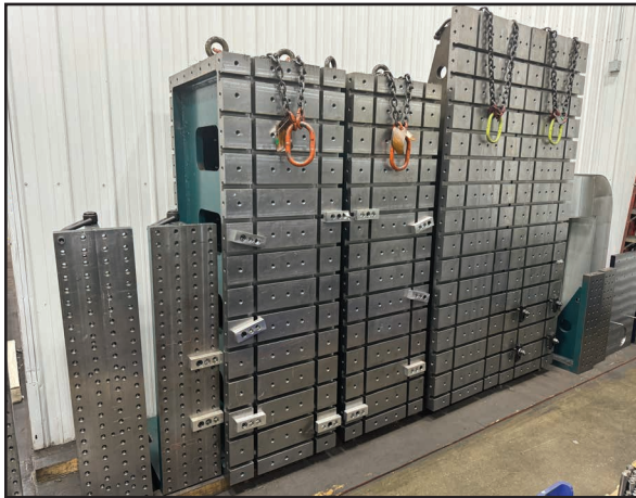
PARTIAL VIEW OF WORKHOLDING FIXTURES