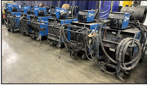
MILLER DELTAWELD 452 WELDERS