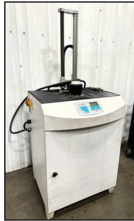
BILZ THERMOGRIP ISG3200 HEAT SHRINK MACHINE

ALSO: KENNAMETAL Tool Carts, Work Benches, LISTA Cabinets, Quality Control, (2) GROB Saws, Granite Tables, Bore Gauges, Plant Support and more!