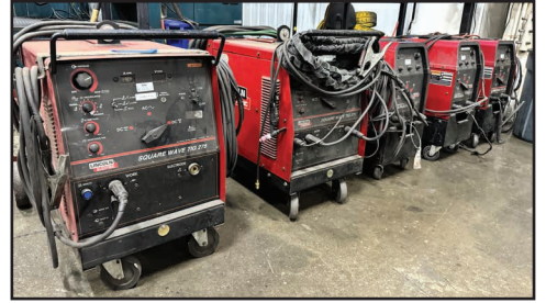
ASSORTED LINCOLN WELDERS