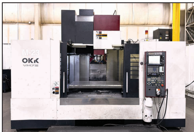
OKK VM7-III VERTICAL MACHINING CENTER