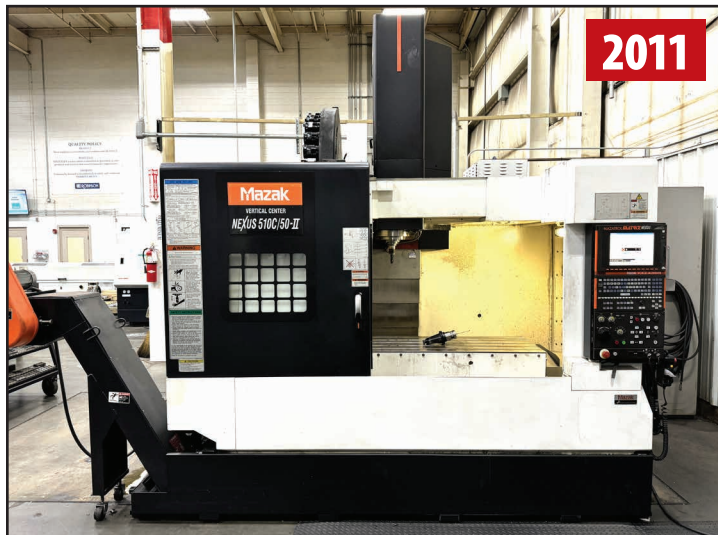
MAZAK VCN-510C/50-II CNC VMC