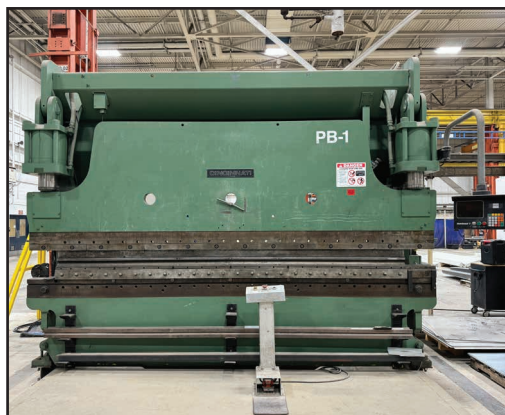
CINCINNATI 230 CBX12 230 TON PRESS BRAKE