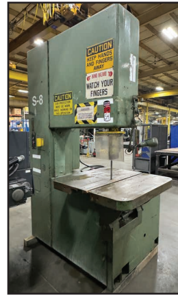
GROB 2536-U VERTICAL SAW