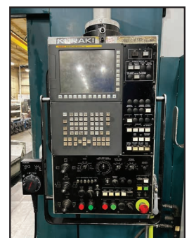
KURAKI CNC CONTROL

2011 KURAKI KBT-13A CNC TABLE TYPE HORIZONTAL BORING MILL, s/n 8290, Fanuc 31i-A5 CNC Control, 5.12" Spindle, Travels: X- 118.1", Y- 90", Z- 51" (Saddle), W- 27.5" (Spindle), 70.86" x 86.61" B-Axis Rotary Table, .001 Degree Indexing, Spindle Speeds 5 - 2,500 RPM, 44,000 Lb. Table Capacity, CAT 50 Taper, 60-Position Automatic Tool Changer, Chip Blaster High Pressure Coolant System, Thru Spindle Coolant, Full Chip Enclosure, 40 HP Spindle Motor