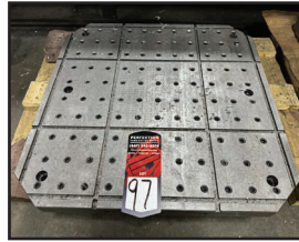
DRILLED & TAPPED PALLET