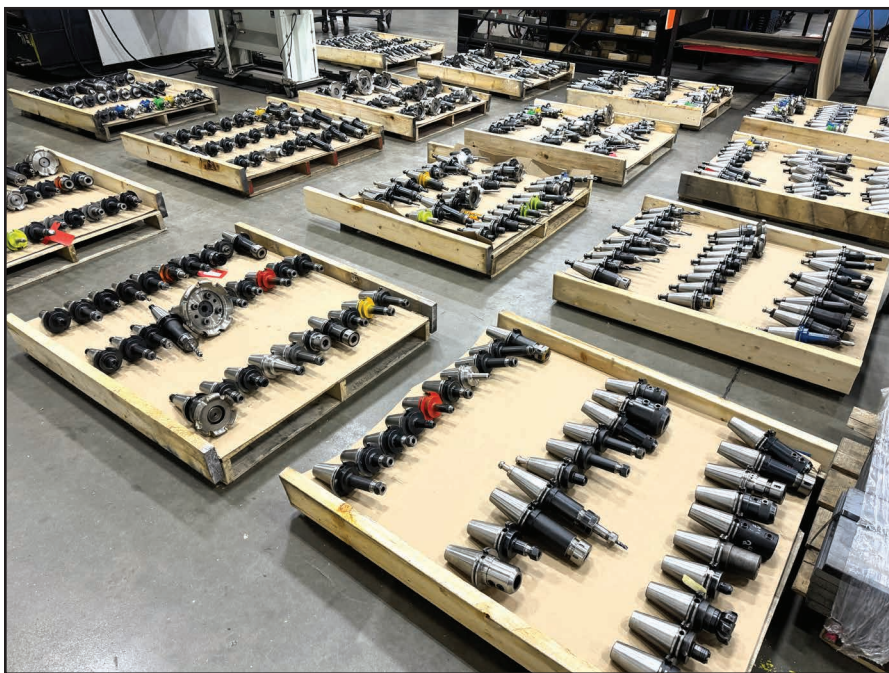
INCREDIBLE QTY OF CAT 50 & KM STYLE TOOLING