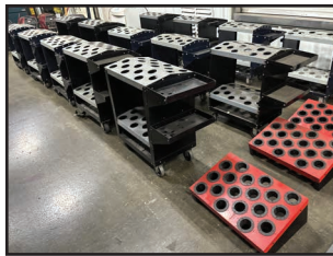
VIEW OF TOOL CARTS