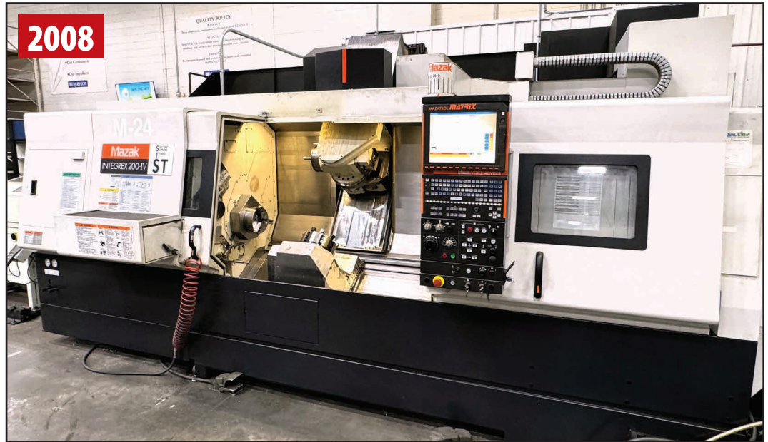
MAZAK INTEGREX 200-IV-ST CNC TURNING & MILLING CENTER

2008 MAZAK QUICK TURN NEXUS 200-II-MY CNC MULTI-TASKING MACHINE , Mazatrol Matrix Nexus CNC Control, 26.5" Swing, 23" Max Machining Length, 2.6" Max. Bar Work, Spindle: 5000 RPM / 30 HP, 12-Station Turret, Live Milling, C-Axis, Y-Axis, Tool Presetter, Tailstock Chip Conveyor, S/N 199630