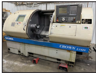
OKUMA CROWN L1420 CNC TURNING CENTER