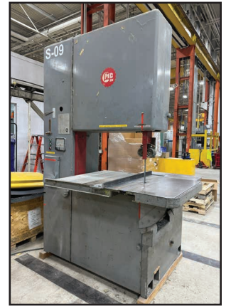
GROB 2536-U VERTICAL SAW