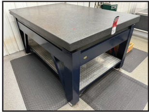
(1 OF 2) GRANITE TABLE