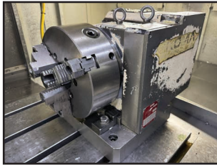
TSUDAKOMA RNA-250RB 4TH AXIS ROTARY