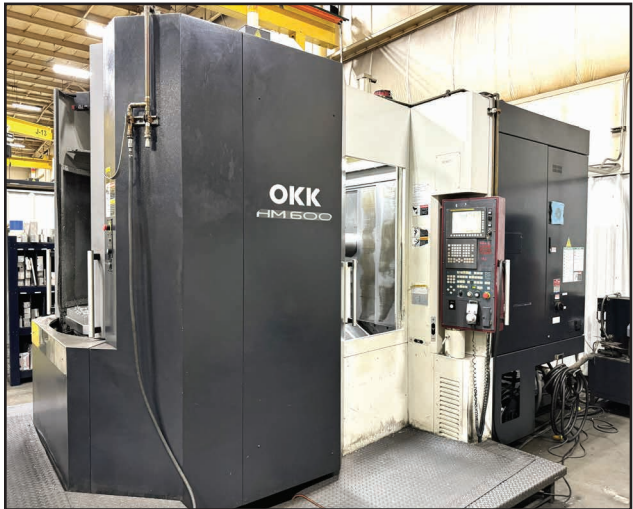
OKK HM 600 4-AXIS CNC HMC