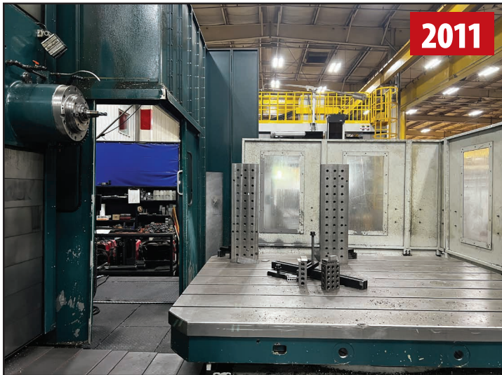
VIEW OF KURAKI WORK AREA