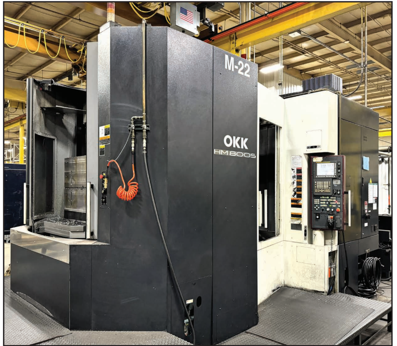
OKK HM 800S 4-AXIS CNC HMC

OKK HM 600 4-AXIS CNC HORIZONTAL MACHINING CENTER , Fanuc 310iS-A CNC Control, (2) 24.8" x 24.8" Pallets, Travels: X-30.7", Y-29.5", Z-31.5", 13,000 RPM, Full B-Axis, 60-Position Automatic Tool Changer, CAT 50 Taper, Thru Spindle Coolant, Spindle Chiller, Hydraulic Clamping, Chip Conveyor, S/N 431