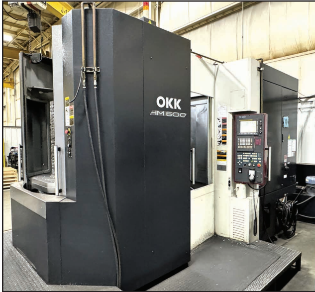
OKK HM 600 4-AXIS CNC HMC