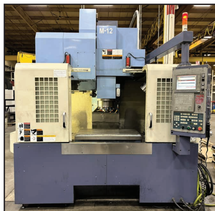
OKK VM5-III VERTICAL MACHINING CENTER

PRE-AUCTION OFFERS INVITED ON MAJOR ASSETS