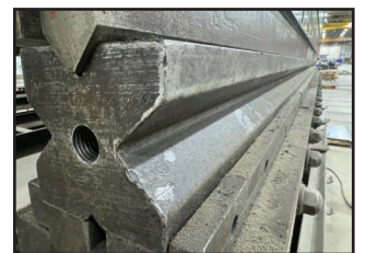
4-WAY PRESS BRAKE DIE