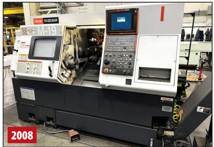
MAZAK QTN 200-II-MY CNC MULTI-TASKING MACHINE

OKK VM5-III 3-AXIS CNC VERTICAL MACHINING CENTER , Neomatic 635V CNC Control, 41" x 22" Table, Travels: X-40", Y-40", Z-20", 6,000 RPM, CAT 50 Taper, 20-Position Automatic Tool Changer, Spindle Chiller, Chip Conveyor, S/N 1352