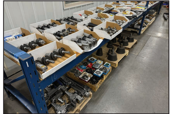
DURABLE & PERISHABLE TOOLING