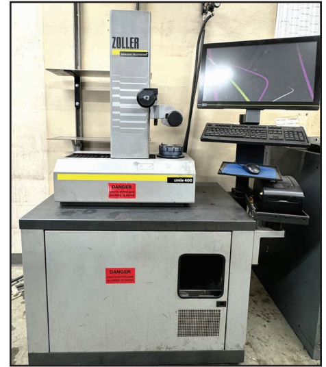
ZOLLER SMILE 400 TOOL PRESETTER

For auction inquiries, please contact Jennifer Reiner at (847) 545-6374 or jennifer@perfectionindustrial.com