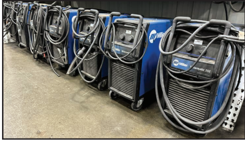
MILLER MILLERMATIC 252 WELDERS

(33+) LINCOLN & MILLER WELDERS, including Miller Deltaweld 452 with Wire Feeders, Lincoln Square Wave Tig 275's, Miller Millermatic 252's, Miller CP-302's, Miller Invision 352's, Lincoln Precision Tig 225 and more!