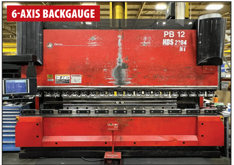
AMADA HDS 2204 NT CNC PRESS BRAKE

CINCINNATI 230 CB X 12 230 TON PRESS BRAKE , (Located in Manitowoc, WI)