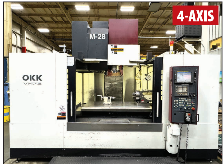
OKK VM7-III VERTICAL MACHINING CENTER