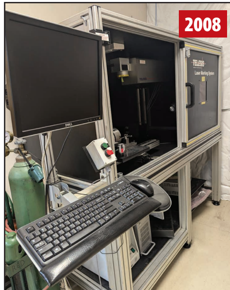
KENTEK TELESIS EV15 DIODE PUMPED LASER MARKING SYSTEM