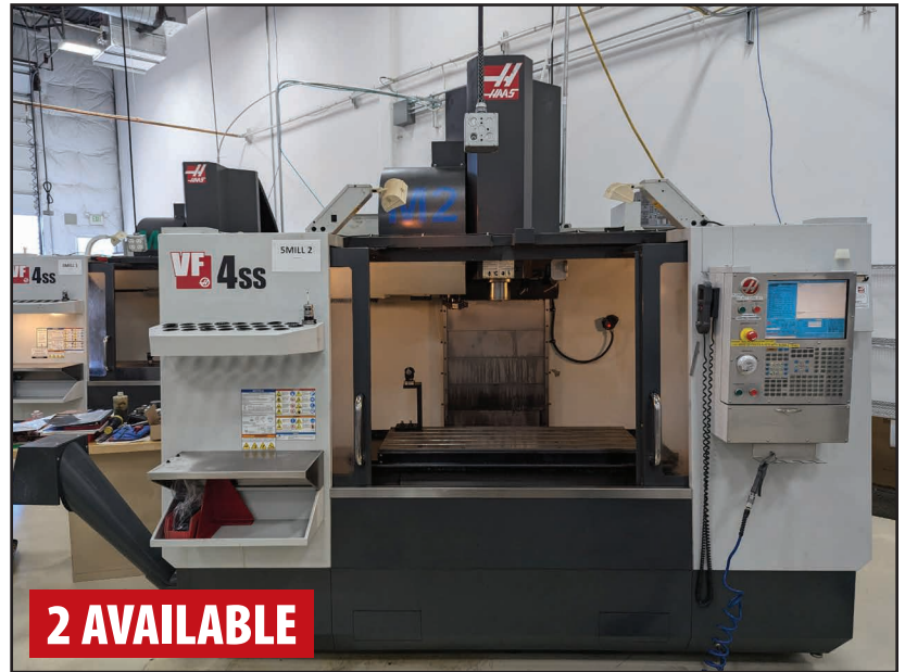
HAAS VF-4SS VERTICAL MACHINING CENTER

2005 HAAS VF-3SS 3SS VERTICAL MACHINING CENTER , s/n 40502, NOTE: Wired for 4th & 5th Axis capability, w/ HAAS Control, Travels: X-40", Y-20", Z-20", 12,000 RPM Spindle, 24+1 Tool Changer, Through Spindle Coolant, 40 Taper, RENISHAW Probe, Chip Auger