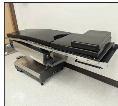
AMSCO 2080 SURGICAL TABLE