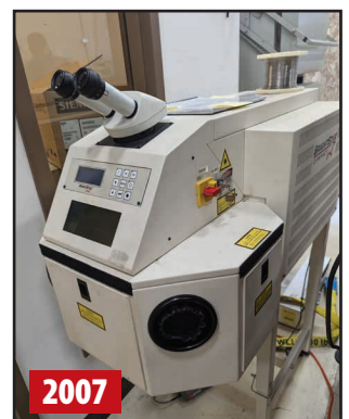
LASERSTAR TECHNOLOGIES BRIGHTSTAR COMPACT 505-120-050-4 LASER MARKER