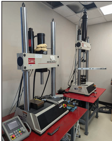
MTS 858 MINI BIONIX II BENCHTOP TEST SYSTEMS