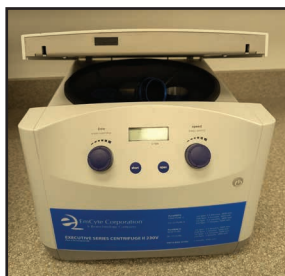
EMCYTE EXECUTIVE SERIES II 230C CENTRIFUGE