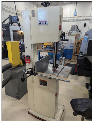
JET JWBS-14SF 14" VERTICAL BANDSAW