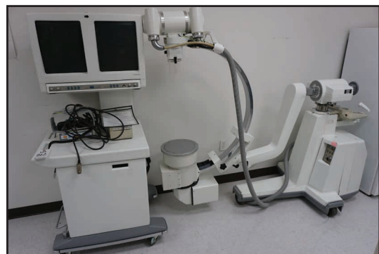
OEC DIASONICS 9400 MOBILE C-ARM X-RAY SYSTEM