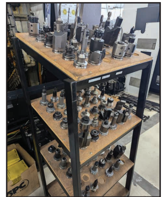
LARGE QTY OF TOOLING