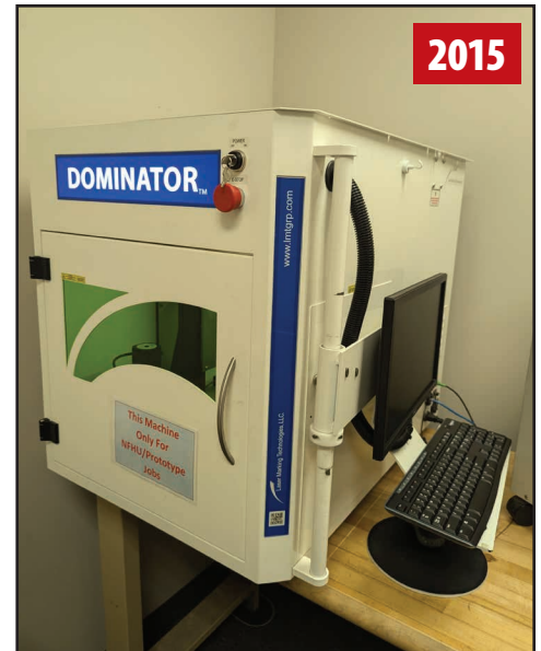
LASER MARKING TECHNOLOGIES DOMINATOR COBALT-DOM-30PF LASER MARKING SYSTEM