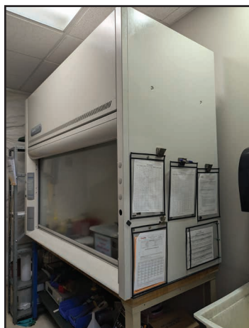
LABCONCO PROTECTOR LABORATORY HOOD