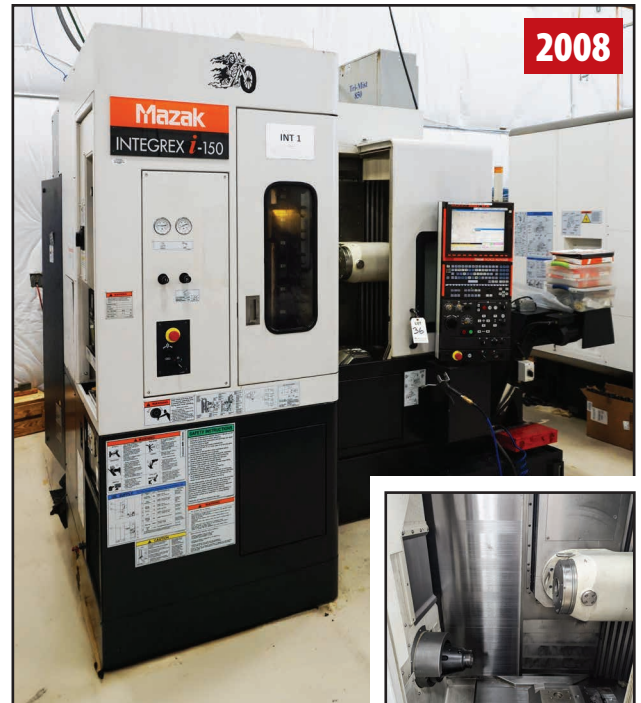
MAZAK INTEGREX I-150 MILL/TURN MACHINE