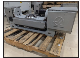
HAAS TR210H 5-Axis Trunnion Table