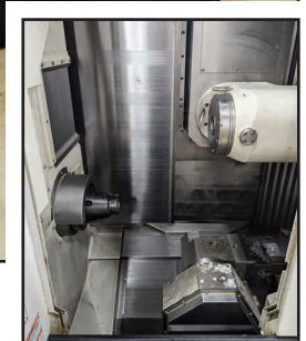
MAZAK I-150 INTERIOR VIEW