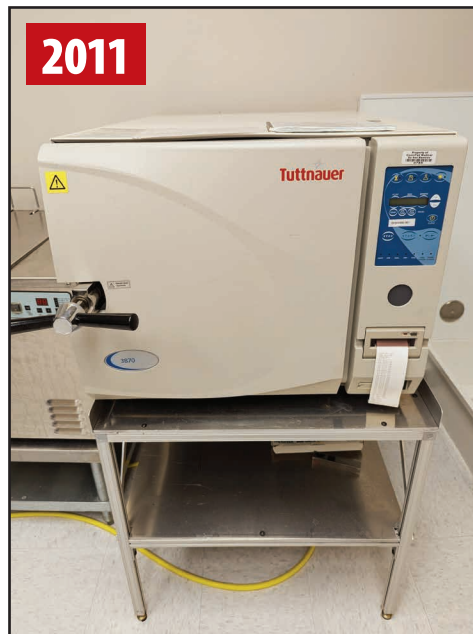
TUTTNAUER 3870EA AUTOCLAVE STERILIZER