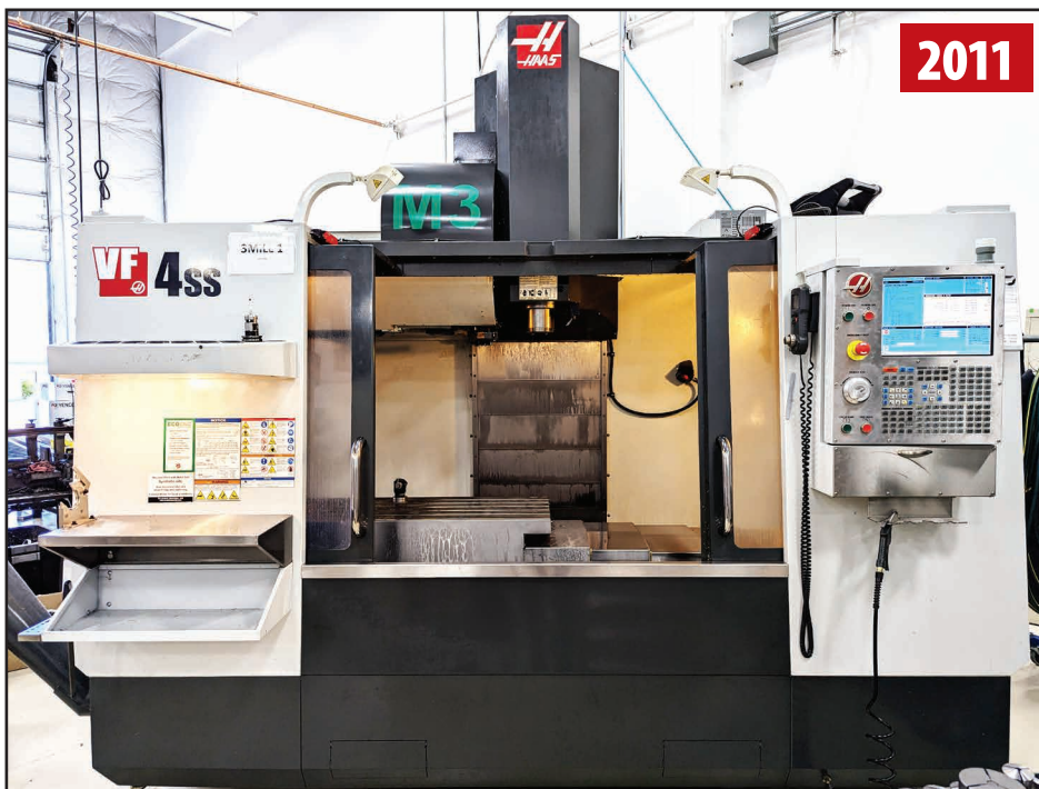
HAAS VF-4SS VERTICAL MACHINING CENTER

(4) MAZAK INTEGREGX Mill/ Turn Machines, New as 2015; (4) HAAS VF-4SS & VF-3SS 5 Axis VMC's, New as 2011; 2011 TSUGAMI S206 Swiss Turn Machine; (2) SODICK Wire EDM's; Tooling; (2) MTS 858 Mini Bionix II Test Systems; Laser Marking Systems; Extensive QA Department; Lab Equipment; Medical Instruments; & Factory Support