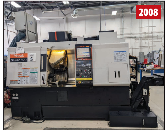
MAZAK INTEGREX 100-IV S MILL/TURN MACHINE