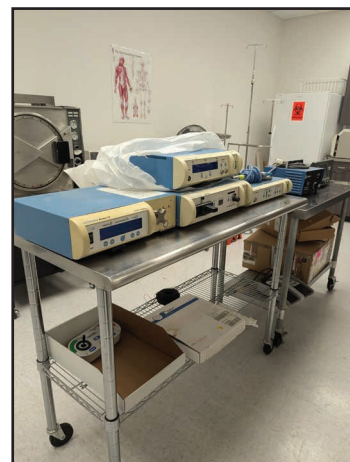
DYONICS EP-1 ENDOSCOPIC POWERED INSTRUMENT SYSTEM