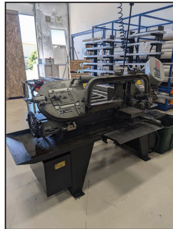
WELLSAW 1016 HORIZONTAL BANDSAW