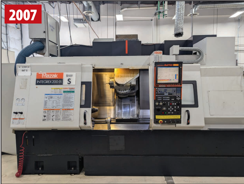
MAZAK INTEGREX 200-IV S MILL/TURN MACHINE

2008 MAZAK INTEGREX 100-IV S MILL/TURN MACHINE , s/n 204239, w/ MAZATROL MATRIX Control, Second Spindle, B Axis Head, High Pressure Coolant, Parts Catcher, Chip Conveyor, Mist Collector