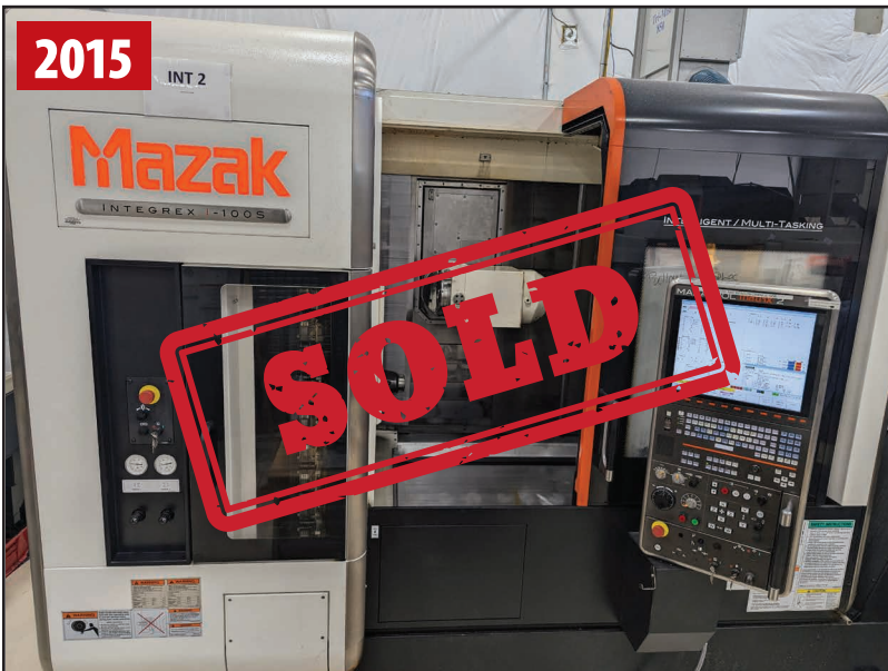
MAZAK INTEGREX I-100 S MILL/TURN MACHINE