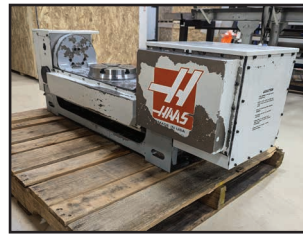
HAAS TR210H 5-Axis Trunnion Table

ALSO: Large Quantity/Selection of Micrometers, Pin Gages, Vernier Calipers, Dial Gauges, Gage Blocks, etc.