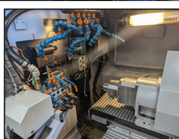
TSUGAMI S206 INTERIOR VIEW