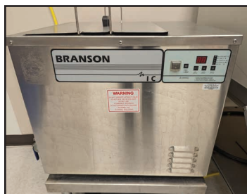
BRANSON IC1620-40-18 BASKET TYPE ULTRASONIC CLEANER