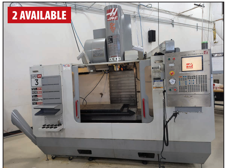
HAAS VF-3SS VERTICAL MACHINING CENTER

2006 SODICK AQ300L WIRE EDM , s/n 0323, w/ SODICK LN1W Control, W Axis, Wire Chopper