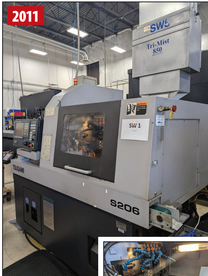
TSUGAMI S206 6 AXIS SWISS TYPE CNC PRECISION LATHE