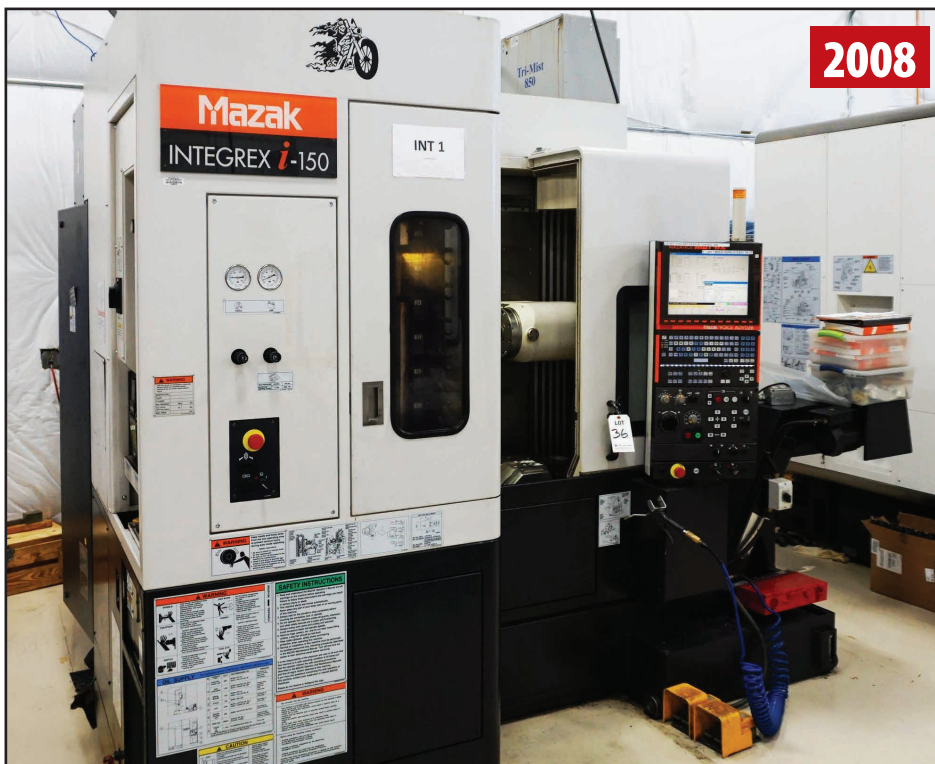
MAZAK INTEGREGX I-150 MILL/TURN MACHINE