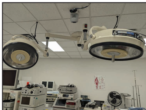
AMSCO CENTRA 360 CEILING MOUNTED ARTICULATING SURGICAL LIGHTING SYSTEM