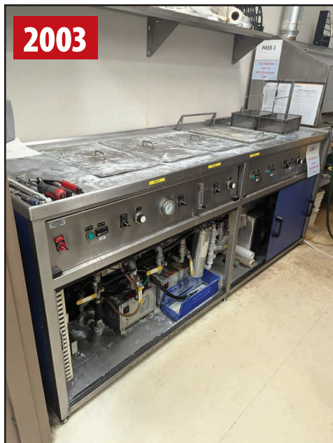
BLUE WAVE ULTRASONICS SEC-2000/1218 4-STAGE WASH, RINSE, DRY SYSTEM

ALSO: UNKNOWN MAKE 316L STAINLESS STEEL PASSIVATION TANK SYSTEM , for Nitric Acid, (2) CREST ULTRASONICS Ultrasonic Cleaners, Rinse Tank, X-Ray Lead Aprons, STRYKER Autoclavable Arthroscopes