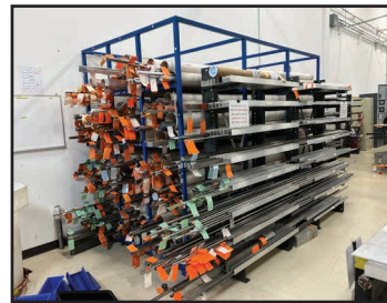
LARGE SELECTION OF TOOL STEEL & BAR STOCK