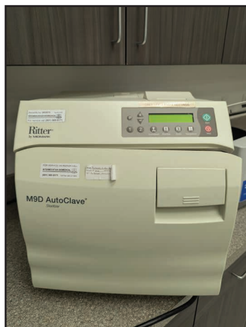
MIDMARK RITTER M9D-022 AUTOCLAVE STERILIZER