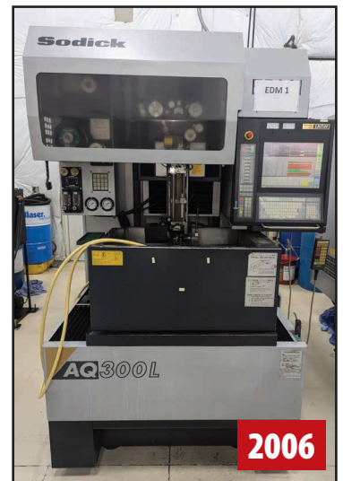
SODICK AQ300L WIRE EDM