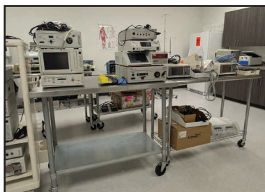
ASSORTMENT OF INSTRUMENTS & COMPONENTS