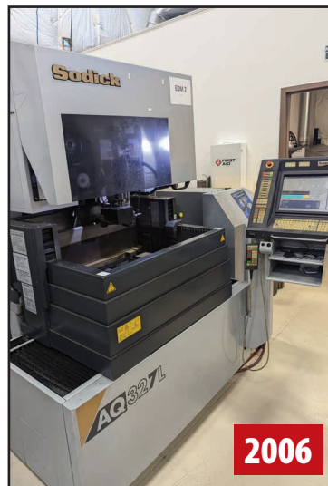
SODICK AQ327L WIRE EDM