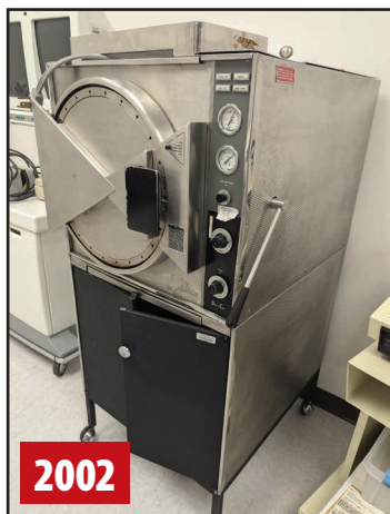
2002 PELTON & CRANE MC MAGNA-CLAVE AUTOCLAVE