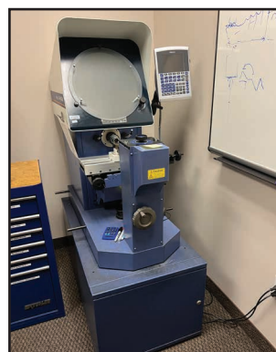
MITUTOYO PH-A14 OPTICAL COMPARATOR